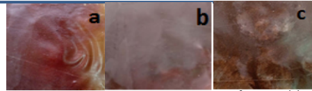
Figure 1. Images of three different types of mixing (a) PLA (90%)/Wood (10%), (b) PLA (80%)/Wood (20%) and (c) PLA (50%)/Wood (50%)

This project represents an innovative study that, for the first time, explores the possibility to use agricultural wastes to produce biopolymers. This research activity aimed at performing an environmental analysis of the new territorial structures of Montesano, a small village near to Lecce. An original green method will be applied to extract cellulose from the agricultural wastes (work will be done in University of Alicante, Spain). Biopolymers are readily processed, biodegradable polymers. Bio-polymers come from microbial systems, organisms, and seasonal crops and plants including maize, wheat, potato, and sugarcane. These polymers are widely used in food, textiles, cosmetics, pharmaceuticals, and industrial plastics